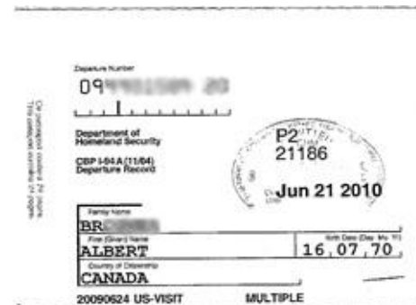
Example of an I-94 Departure Record

The costs of a P2 extension are the same as the costs of a new P2.